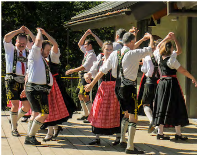
The Alt Washingtonia Schuhplattlers are a traditional part of Oktoberfest at the Hard Bargain Farm.