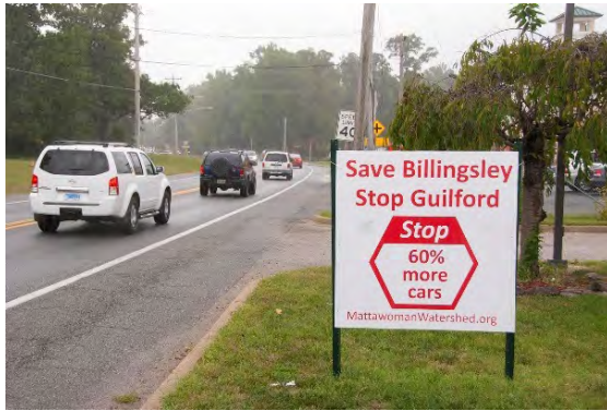
Traffic stacks up on Livingston Road in front of the Bryans Road firehouse to turn left onto Billingsley Road.

As described in the September issue of Smoke Signals , Guilford is the enormous proposed subdivision that would change the character of Bryans Road with 438 housing units, including 140 apartments and 171 townhouses. It is a leftover from the failed Cross County Connector that would have serviced it, and the now-rejected comprehensive plan that aimed to turn Bryans Road into a new urban center. It was approved by the Planning Commission without consideration of the impacts of increasing traffic on Billingsley Road by 60%, and inadequate answers to questions regarding harm to Mattawoman Creek. It also threatens a globally rare magnolia bog. Consequently, the Mattawoman Watershed Society and nearby landowners are challenging the approval of Guilford's preliminary subdivision plan.