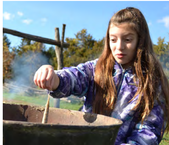
Photo: National Colonial Farm, Accokeek Foundation at Piscataway Park.