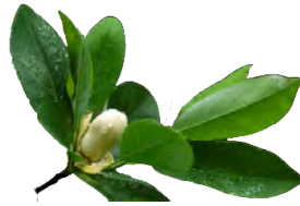
Western Charles County is home to an endangered magnolia bog.

As described in the September issue of Smoke Signals , Guilford is the enormous proposed subdivision that would change the character of Bryans Road with 438 housing units, including 140 apartments and 171 townhouses. It is a leftover from the failed Cross County Connector that would have serviced it, and the now-rejected comprehensive plan that aimed to turn Bryans Road into a new urban center. It was approved by the Planning Commission without consideration of the impacts of increasing traffic on Billingsley Road by 60%, and inadequate answers to questions regarding harm to Mattawoman Creek. It also threatens a globally rare magnolia bog. Consequently, the Mattawoman Watershed Society and nearby landowners are challenging the approval of Guilford's preliminary subdivision plan.