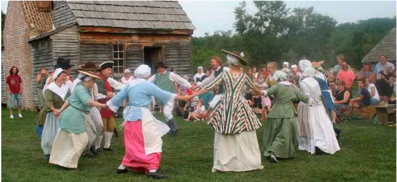
Dancers go wild, colonial-style, at the National Colonial Farm.