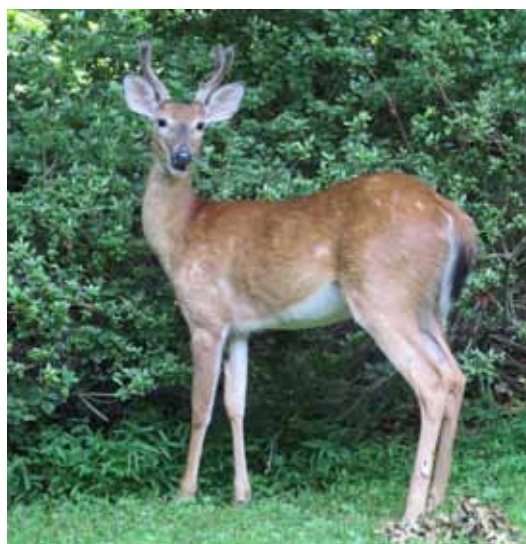
A young buck eating azalea bushes on Reserve Rd.