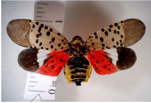
Adult spotted lanternfly with wings spread wide. Note the insect is less than 1 inch long.