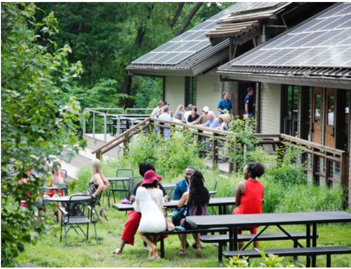
The Alice Ferguson Foundation's fundraiser, Pinot on the Potomac, was a success. Enjoy more Pinot on the Potomac photos at: http://bit.ly/pinotphotos.